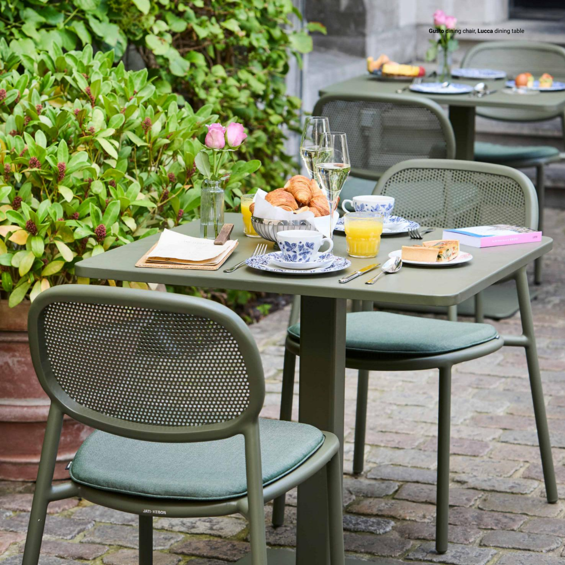
Gusto dining chair, Lucca dining table