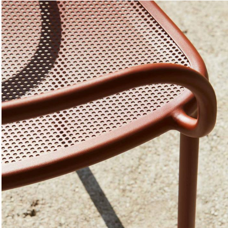
Gusto dining chair